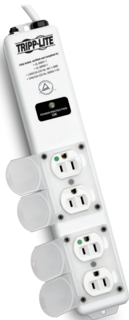
SPS415HGULTRA and SPS406HGULTRA UL 60601-1 Surge Protectors with Fault Protection

Some UL 1363A power strips are marketed erroneously as UL 1363A / UL 60601-1 power strips, but they do not protect against single faults, are not certified for use as standalone power strips and, most importantly, do not provide adequate protection for patients and staff. Since you can't rely on labeling, the safety and code compliance of your facility depends on your due diligence. As you research power strip options, ask the manufacturer these very important questions: