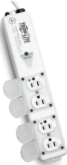
PS-415-HGULTRA and PS-406-HGULTRA UL 60601-1 Power Strips with Fault Protection