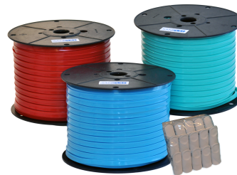
Red, Blue & Green colors available