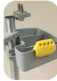
TRAYS & CARTS