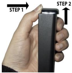
Photo A Open with keypad facing you