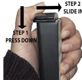
Photo C Close with keypad facing away from you

Optional screw for the battery compartment is in bag with remote