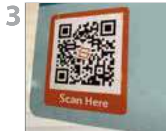
3 Require all employees to download the app and establish a profile – no user limits