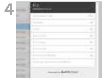
4 Administrative review of Current and Recorded Health Checks/Contact Tracing