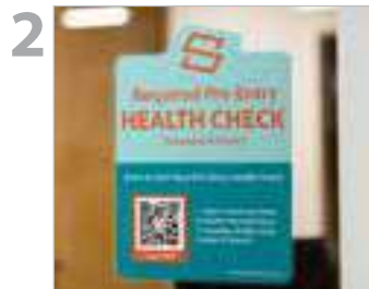
2 Mark entrance-ways with provided labels, deploy & educate