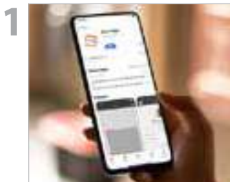
1 HR/Facility Management Downloads App for Dashboard Access & Tracking