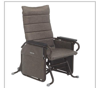
Auto-locking feature increases safety and prevents falls