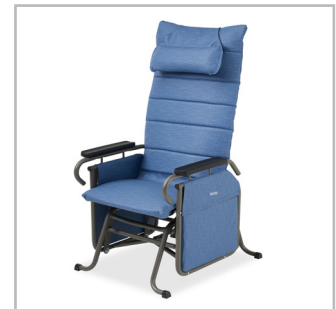
Stimulates active patients and reduces the need to wander