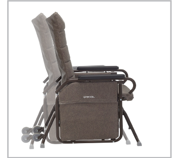
Gentle gliding motion