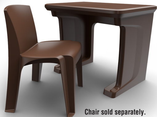
Chair sold separately.