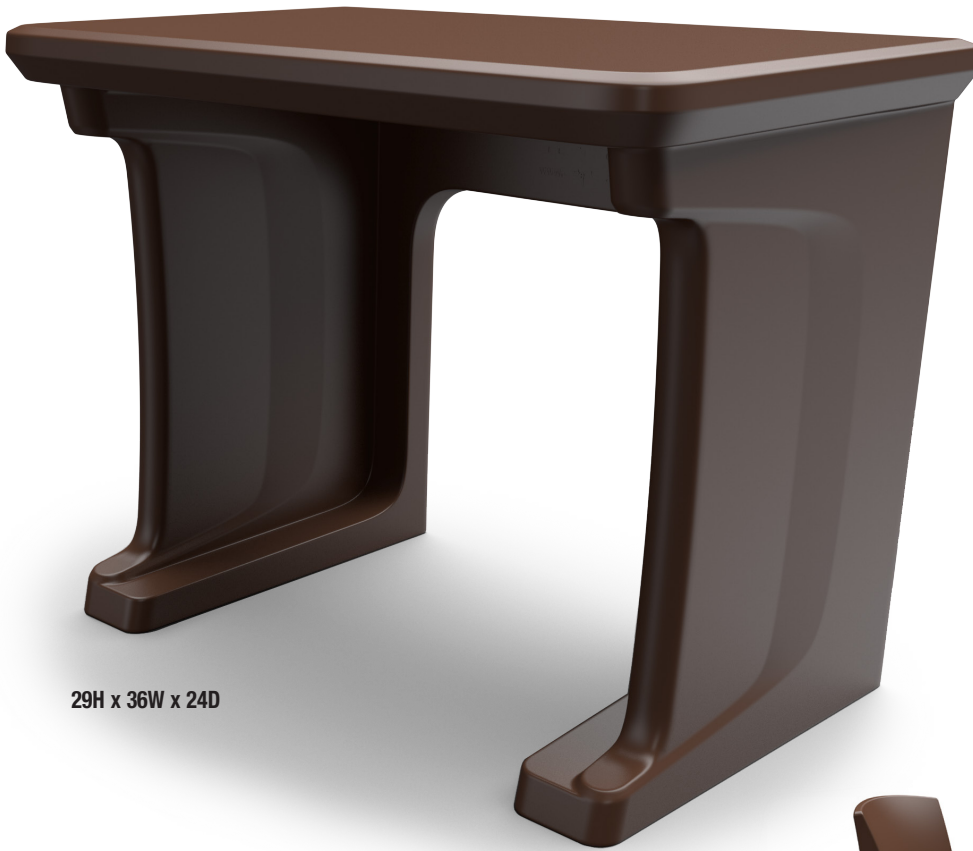
29H x 36W x 24D