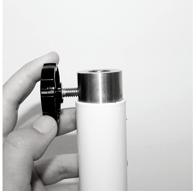
STEP 2 Attach knob to stand