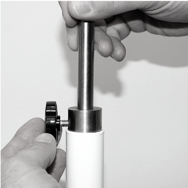
STEP 3 Slide the pole into the stand and use knob to adjust the height