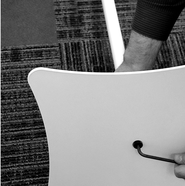
STEP 1 Attach rod to base using a countersunk bolt and tighten with the Allen key