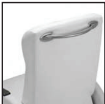
Push Bar AL-87033