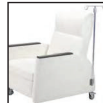
IV Pole and Holder AL-87038