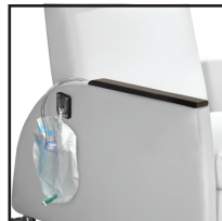
Drainage Bag Holder AL-87036