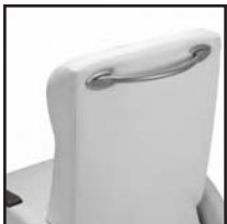
Push Bar AL-87033