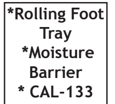
*Rolling Foot Tray *Moisture Barrier * CAL-133 AL-87039 AL-87040 AL-87041