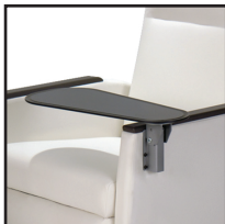
Self Storing Swivel Tablet AL-87034