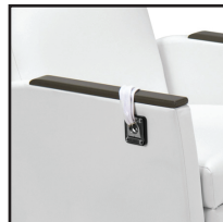
Restraint Strap Loop AL-87037