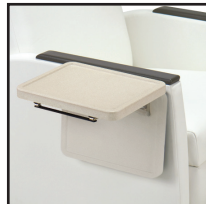
Folding Tablet AL-87035