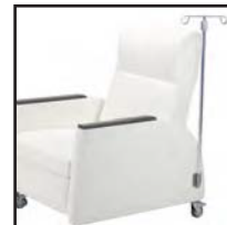
IV Pole and Holder AL-87038