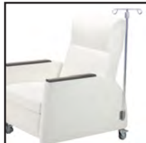
IV Pole and Holder AL-87038