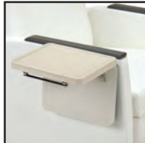
Folding Tablet AL-87035