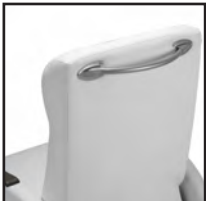
Push Bar AL-87033