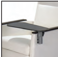
Self Storing Swivel Tablet AL-87034