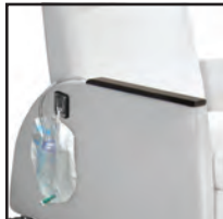
Drainage Bag Holder AL-87036