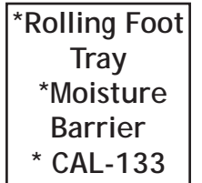
*Rolling Foot Tray *Moisture Barrier * CAL-133 IRC-A-RF IRC-A-MB IRC-A-TB