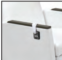
Restraint Strap Loop AL-87037