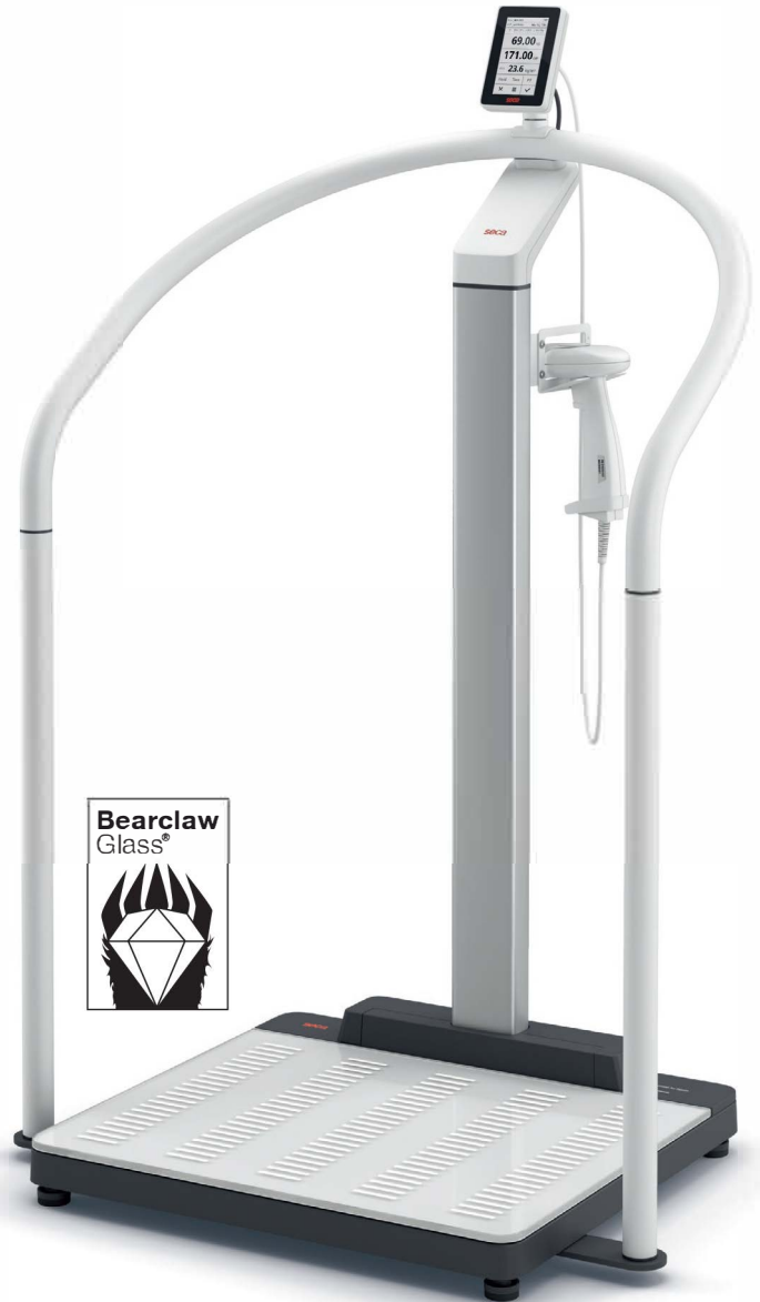
Image contains optional barcode scanner mount and barcode scanner from a third-party supplier