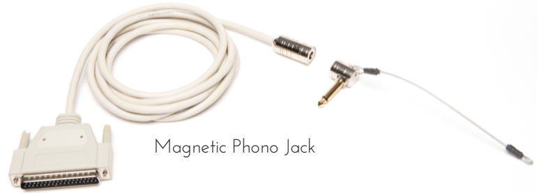
Magnetic Phono Jack

Regardless of if you have multiple bed types or nurse call systems in your facility, installing BlackJack Cables will render them all universally compatible with each other.