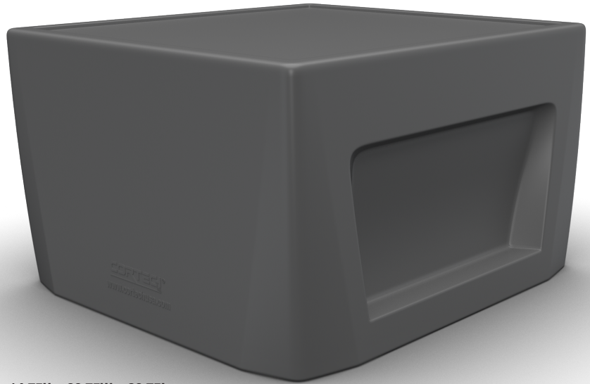
14.75H x 23.75W x 23.75L