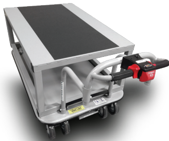
Double Deck Custom Cart Load Capacity 3,000 lbs Deck Size: 35" W by 52" L