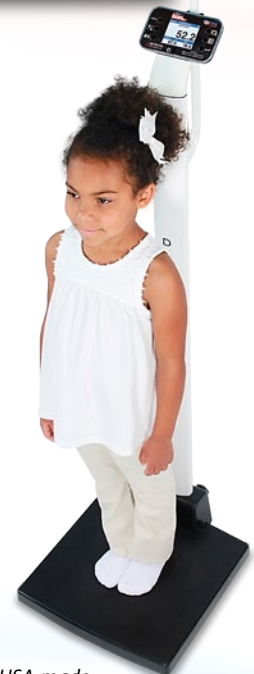
ALCO's USA-made apex® scales measure weight and height efficiently on patients of all ages and sizes.

ALCO's icon® eye-level digital clinical scale has a dual-ranging capacity of 0.2 lb/0.1 kg up to 600 lb/300 kg and 0.5 lb/0.2 kg up to 1,000 lb/500 kg. The low-profile 17 in W x 17 in D platform is nearly flat at only 1.5 inches high. The AL-83909 includes a non-medical grade standard AC adapter or can be powered by 12 AA batteries (not included). The touchless sonar height rod allows you to simply step on the scale and within seconds weight, height, and Body Mass Index will all be displayed onscreen without touching a single key.