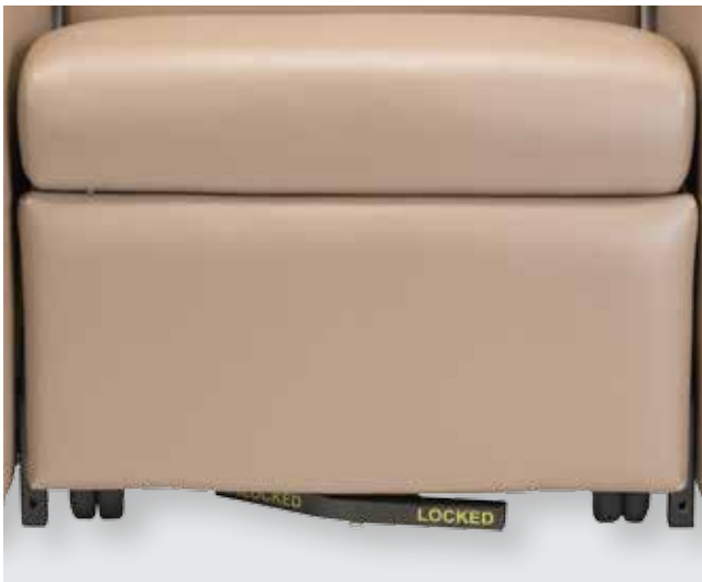
The Central Front Braking option (CFB).

Augustine is designed to mimic furniture that you would be proud to have in your own home.