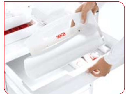
The measuring mat can be rolled up for space-saving storage.