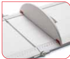
The measurement results are easy to read from the large scale.

A hinge joins together the two parts of the AL-82369 measuring board. It has an integrated head piece and a separate foot positioner that smoothly runs along the gently raised guide rail. For a precise measurement, all the user has to do is place the head of the child against the head piece, stretch out the legs and move the foot positioner to the soles of the feet.