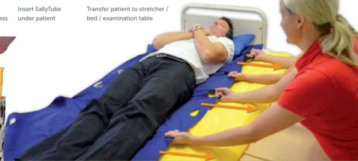
Illustration above demonstrates use of SallyTube ® (AL-81874A) with Draw Sheet & Handles

Transfer patient to stretcher / bed / examination table