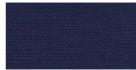
SILVERTEX SAPPHIRE BLUE