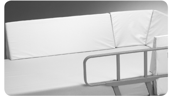
Horseshoe Wedge (AL-76970) joined with optional Side Rail Wedge