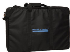
Carrying Case for 553KL Item # 553CASE