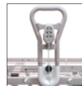
AL-75557 (head end, pair) AL-75558 (foot end, pair)