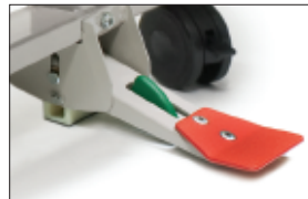
AL-75556 With Pedal Lock

Liberty Lock One-step red/green pedal locking system maximizes security. Locked position can be seen from a distance. The Liberty Brake can be added as a retrofit.