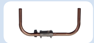
Infusion Pump Holder Multiple Holder