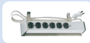
Hospital Grade Outlet Six outlet strip