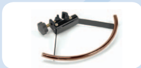
Patient Handle Handle CuVerro