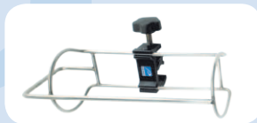
O 2 Tank Holder / E-size Stainless Steel