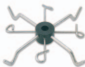
IV Set Organizer