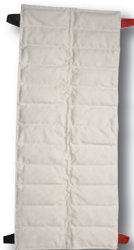
Y large spine