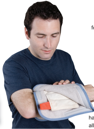
AB standard pack with foam-filled terry cover with pocket