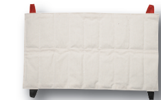
X small spine