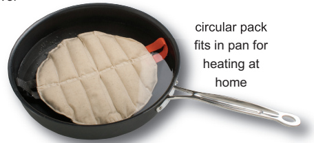
circular pack fits in pan for heating at home