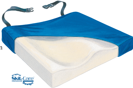
Conform Cushion AL# 62377