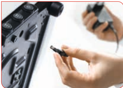
Can be operated by battery or power adapter.

Comfortable and reliable weighing process.