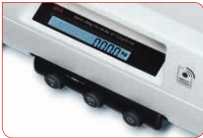
The new backlit LCD display ensures an easy reading of the digits, even in dimmed rooms.

A baby can certainly be fidgety while being weighed, but this is no problem with the AL-61982. Even if the baby is moving and starts to wriggle around, the scale delivers precise measurements within seconds thanks to its highly sensitive weighing technology. Its optimized damping system levels off any vibrations caused by the baby's movements, enabling medical staff to concentrate completely on the weighing process.