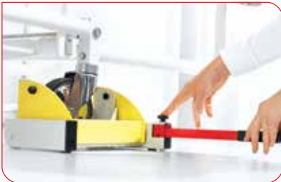
The patented lift mechanism permits placement of the load cells without any effort.