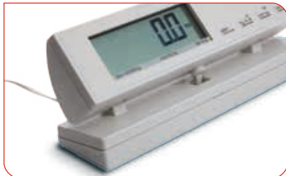
Infinitely adjustable tilt angle in display and operating element for installation on a desk or wall.