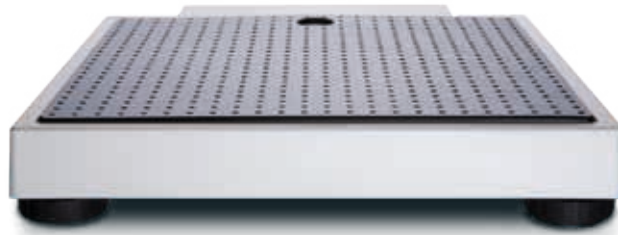
Compact design and low weight for great carrying comfort and universal usage.