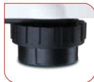
Leveling base on the bottom of the scale base for safe and secure placement.