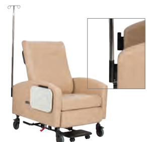
IV holder mount allows IV pole to remain relatively stationary when the swing arm (option) is in operation