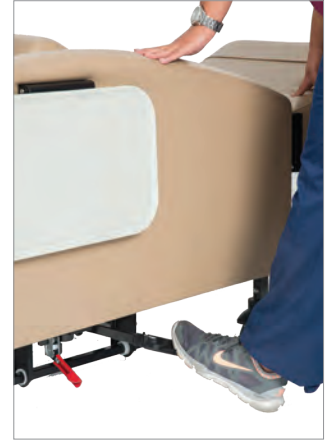
Foot lever for exclusive Secure-Glide™ Trendelenburg descent