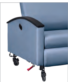
Urethane Arm Cap (option) >>

The Urethane cap option provides unique styling, firm support, and extended arm cap life.