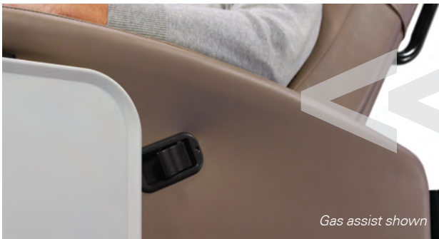
Gas assist shown

All Clinical Care Recliner models feature a push back action in order to raise the footrest, and both offer convenient and comfortable infinite positioning of the back rest. Clinical Care Recliner offers two methods of control of that positioning.