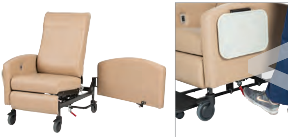
Upholstered arm shown

Facility utility is enhanced through the availability of two arm configurations. Standard fixed arms are cost effective, sturdy and durable. Optional swing arms allow 180 degree swing-away movement of the arm for convenient cleaning access and barrier-free patient transfer.