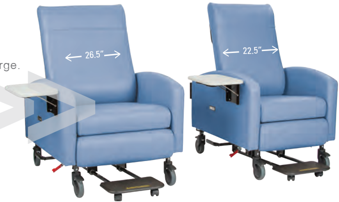
X-Large 500 lb Capacity