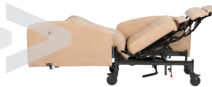
Secure-Glide™ for stress-free positioning

Secure-Glide™ provides gentle patient positioning while preventing clinician strain. The controlled descent helps eliminate any need, or natural reflex, to strain to control the rapid patient positioning in emergency situations.