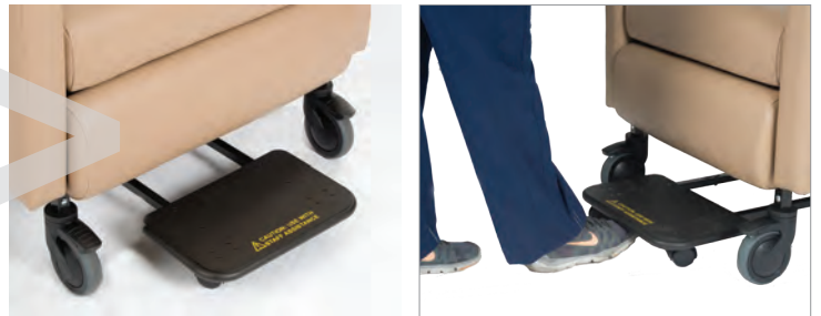
Footplate is easily positioned by foot.

Patients should be assisted at all times by a staff member when using the footplate.