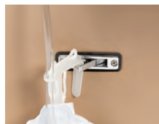
Accessory Hook (shown here with Foley bag)