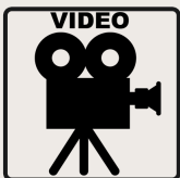
Bedside & Washroom Video