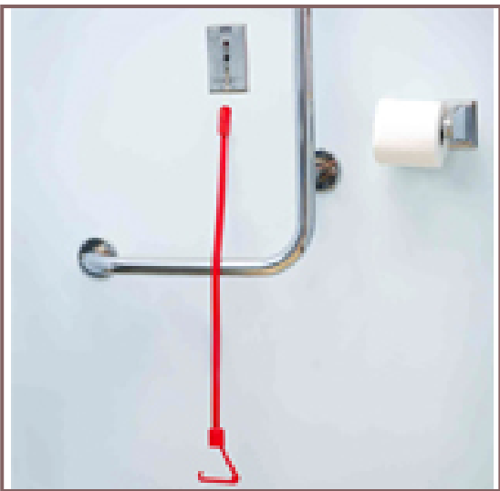
Washroom Nurse Call