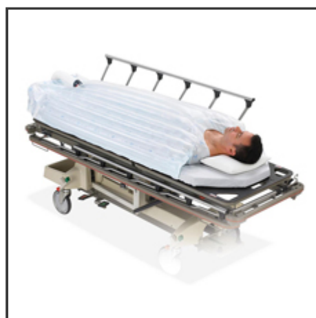
3M™ Bair Hugger™ Parts