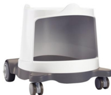
Bair Hugger™ Rolling Cart