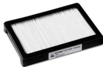
Bair Hugger™ Filter