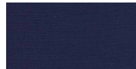
SILVERTEX SAPPHIRE BLUE