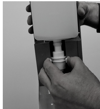
STEP 6 Remove Soap Dispenser