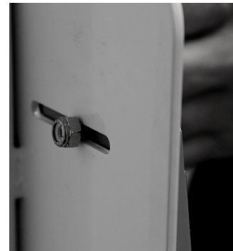
STEP 8 Attach nut to the otherside of the stand