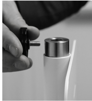
STEP 3 Attach knob to stand