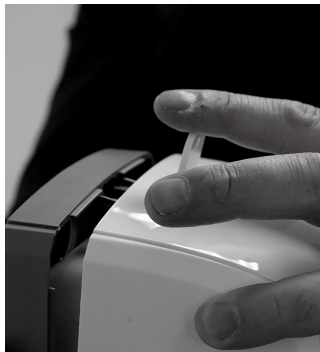
STEP 5 Open the Hand Sanitizer with opening clip