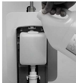
STEP 10 Pour any kind of liquid/gel hand sanitizer into soap dispenser