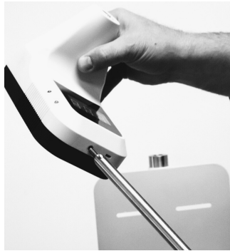
STEP 2 Screw the Thermometer onto the pole