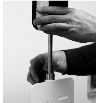
STEP 4 Slide the pole into the stand and use knob to adjust the height