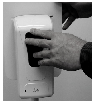
STEP 11 Shut lid of the hand sanitizer to complete installation.