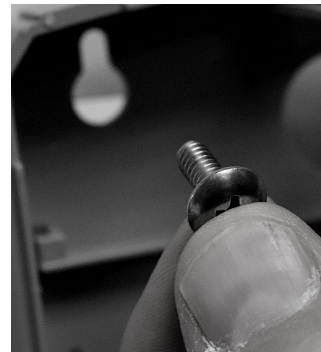
STEP 7 Screw the back of Hand Sanitizer to the stand with a screwdriver