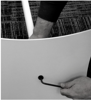
STEP 1 Attach rod to base using a countersunk bolt and tighten with the Allen key