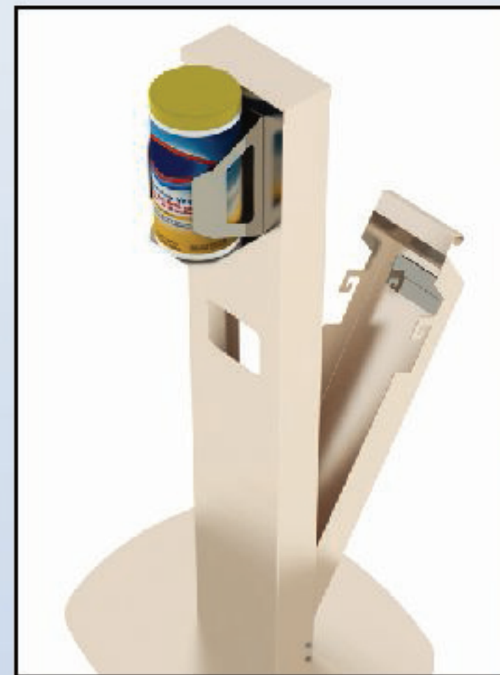
Back panel swings open for refuse bag replacement.