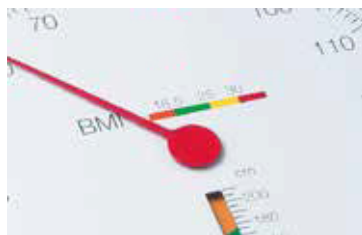
It is easy to determine BMI with the colorcoded dial.