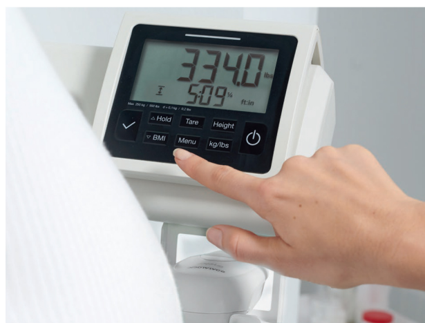
A generous two-line display shows weight and height simultaneously and automatically calculates patients' BMI.