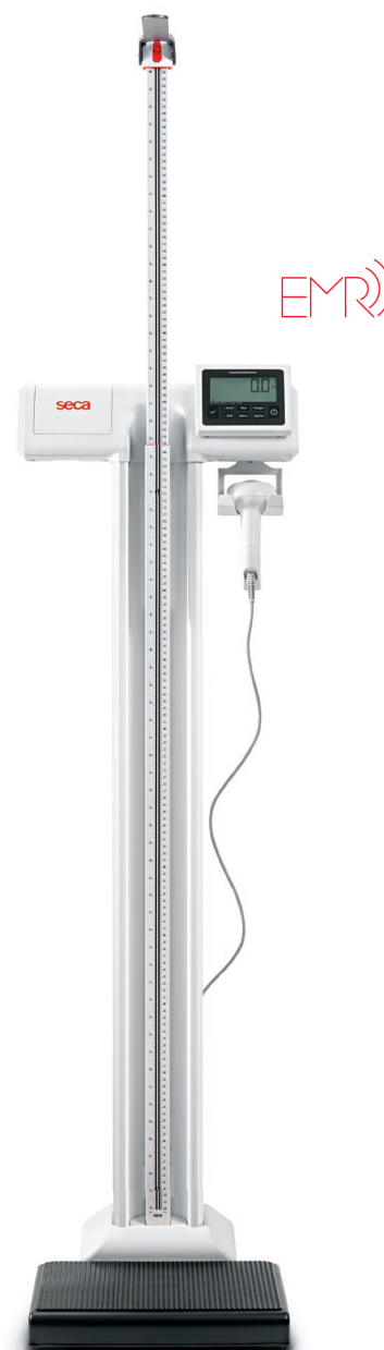
Image contains barcode scanner from a third-party supplier