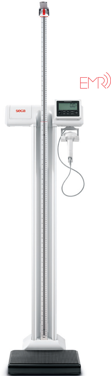
Image contains barcode scanner from a third-party supplier