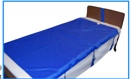
AL-85680 Universal Glide Sheet