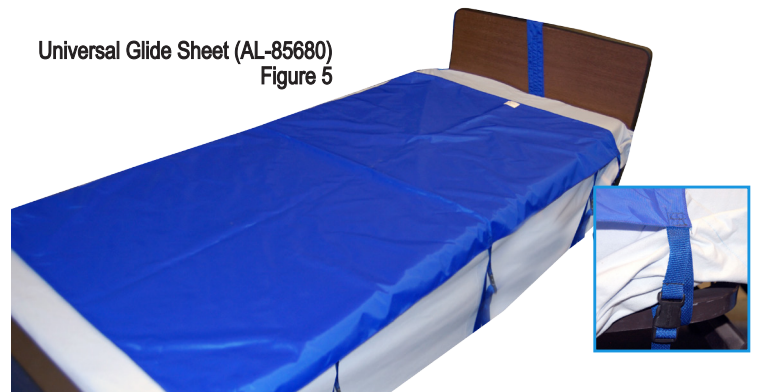
Universal Glide Sheet (AL-85680) Figure 5

Lower the bed rail, remove the positioning wedges and disconnect the strap on the slide sheet from the bed frame. Using the handles on the slide sheet, one or two staff members can slide the patient over to a stretcher, gurney, etc.