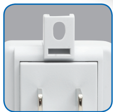
Locking tab mounts to wall outlet plate (optional) for compliance and security