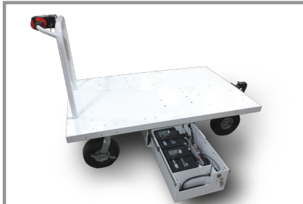
Custom Motorized Cart for NASA Load Capacity: 2,000 lbs | Deck Size: 36" W by 72" L

For unconventional applications where a standard cart will not work, ALCO specializes in custom motorized platform carts and trailers. Our team of engineers work with you to modify standard carts, retrofit your current carts, or custom design carts to fit your specifications. Please call for custom quotes!