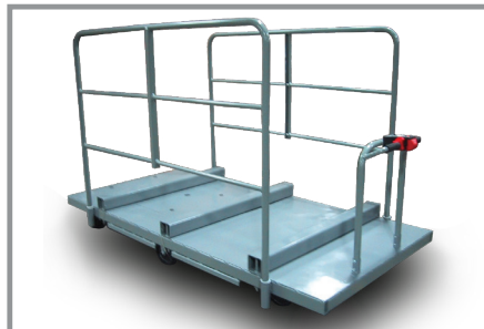
Wood Cart for Industrial Pump Manufacturer Load Capacity: 4,000 lbs | Deck Size: 50" W by 96" L