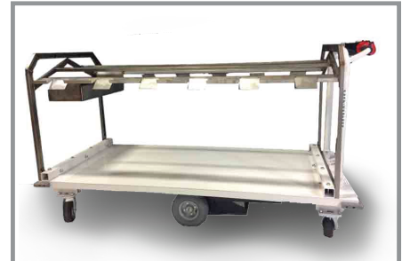
Cart with Stainless Steel Rack Load Capacity 1,500 lbs | Deck Size: 31" W by 70" L