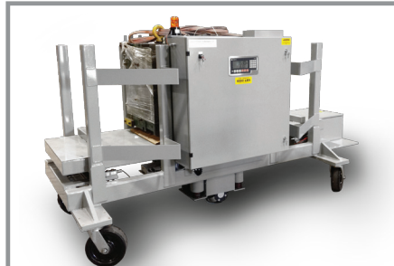
Transfer Cart Load Capacity: 8,000 lbs | Deck Size: 30" W by 96" L