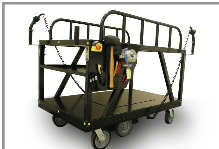
Stock Picking Cart Load Capacity: 2,000 lbs | Deck Size: 36" W by 60" L