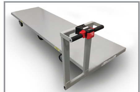
Move 4,000 pounds with one hand Load Capacity: 4,000 lbs | Deck Size: 34" W by 122" L