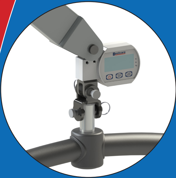
AL-82505 Shown with AL-82531