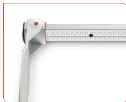
Movable calipers at one end of the measuring rod make this instrument suitable for use with both babies and toddlers.