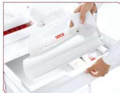
The measuring mat can be rolled up for space-saving storage.