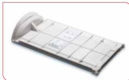
The high-quality folding mechanism guarantees a long service life.

The AL-82369 stadiometer is ideal for mobile use. During regularly scheduled examinations, medical personnel check the nutritional condition and development of infants and toddlers. The process should go quickly, so it's important to be able to read results easily. The red markings and high-quality printing of the scale don't fade even after years of intense use.