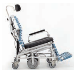
14° Posterior tilt