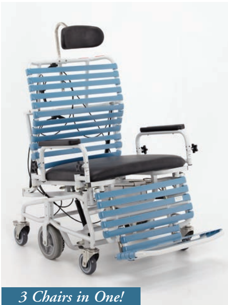
3 Chairs in One!