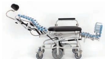
65° Back recline

Width adjustable armrests accommodate widths up to 33"