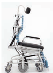
8° Anterior tilt