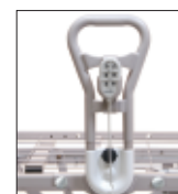
AL-75557 (head end, pair) AL-75558 (foot end, pair)