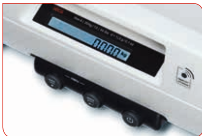
The new backlit LCD display ensures an easy reading of the digits, even in dimmed rooms.

A baby can certainly be fidgety while being weighed, but this is no problem with the AL-61982. Even if the baby is moving and starts to wriggle around, the scale delivers precise measurements within seconds thanks to its highly sensitive weighing technology. Its optimized damping system levels off any vibrations caused by the baby's movements, enabling medical staff to concentrate completely on the weighing process.