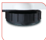
Leveling base on the bottom of the scale base for safe and secure placement.